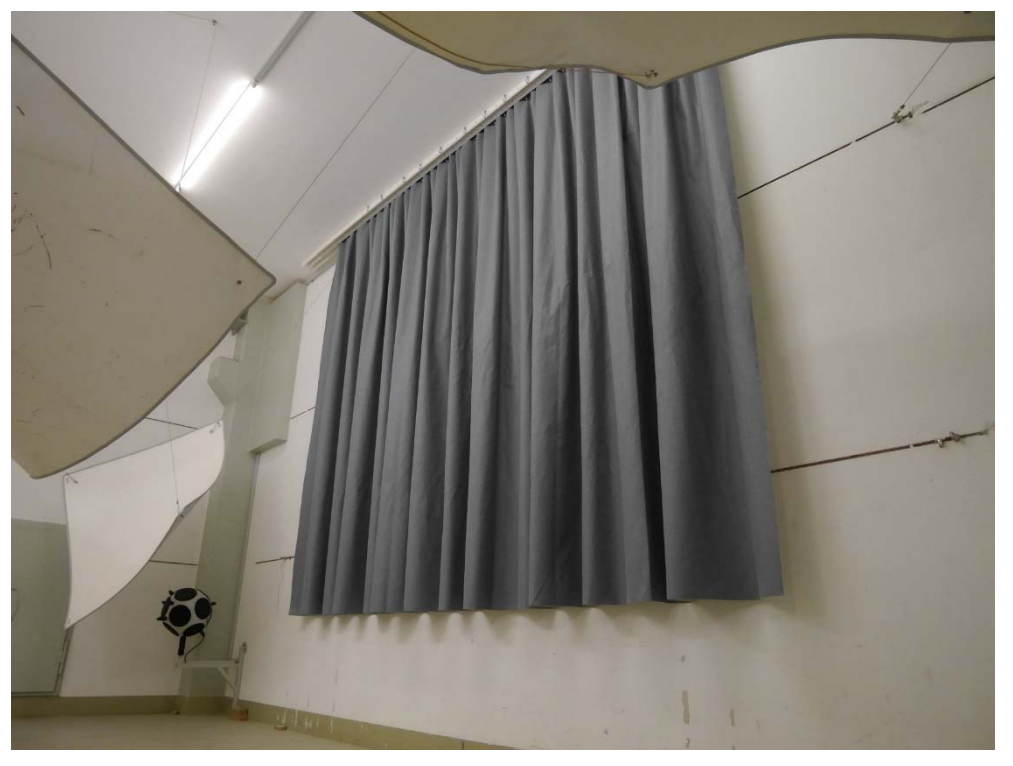
Figure B.2. Test object mounted in the reverberation room, diagonal view.